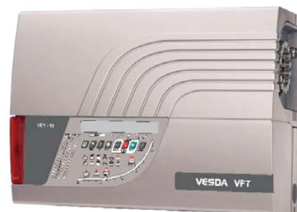
Xtralis VESDA VFT

Contact your local Xtralis VESDA distributor for more information about the Xtralis VESDA VFT-15.