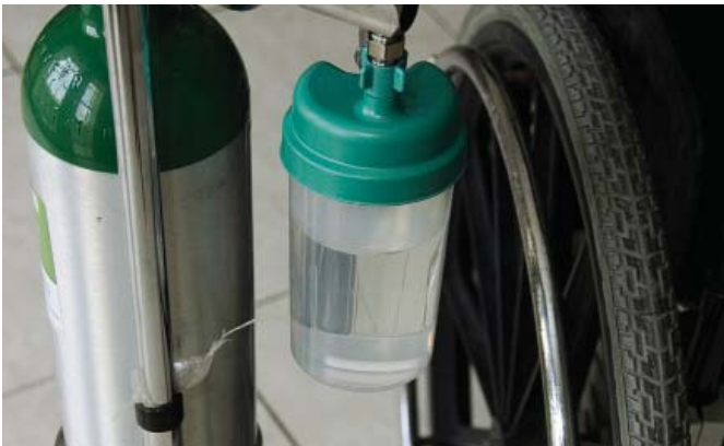
The hidden fuel load in a hospital is significant. Consider the distribution of bottled oxygen throughout the facility.