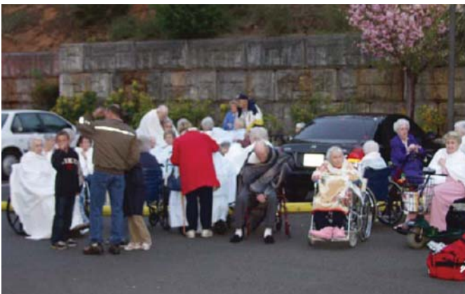
The cost, complexity and inconvenience of evacuating the elderly and frail is best avoided, especially in the event of a nuisance alarm.