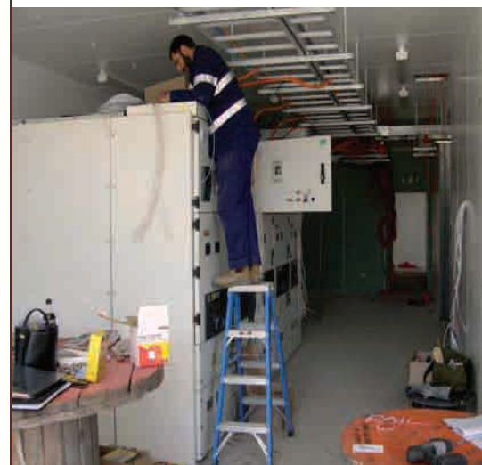
Capillary tubes branch off the main Xtralis VESDA sampling pipe and into the equipment cabinet, allowing the earliest possible warning of smoke within the cabinet.

www.xtralis.com www.vesda.ru Дистрибьютор в России (СНГ) +7 495 967 9339 +7 495 502 6619