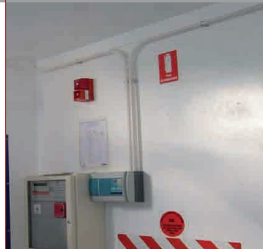
An Xtralis VESDA detector can be installed inside the portable substation or switchroom whilst it is being built or retrofitted onsite.